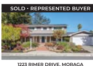
1223 RIMER DRIVE, MORAGA SOLD FOR $1,795,000